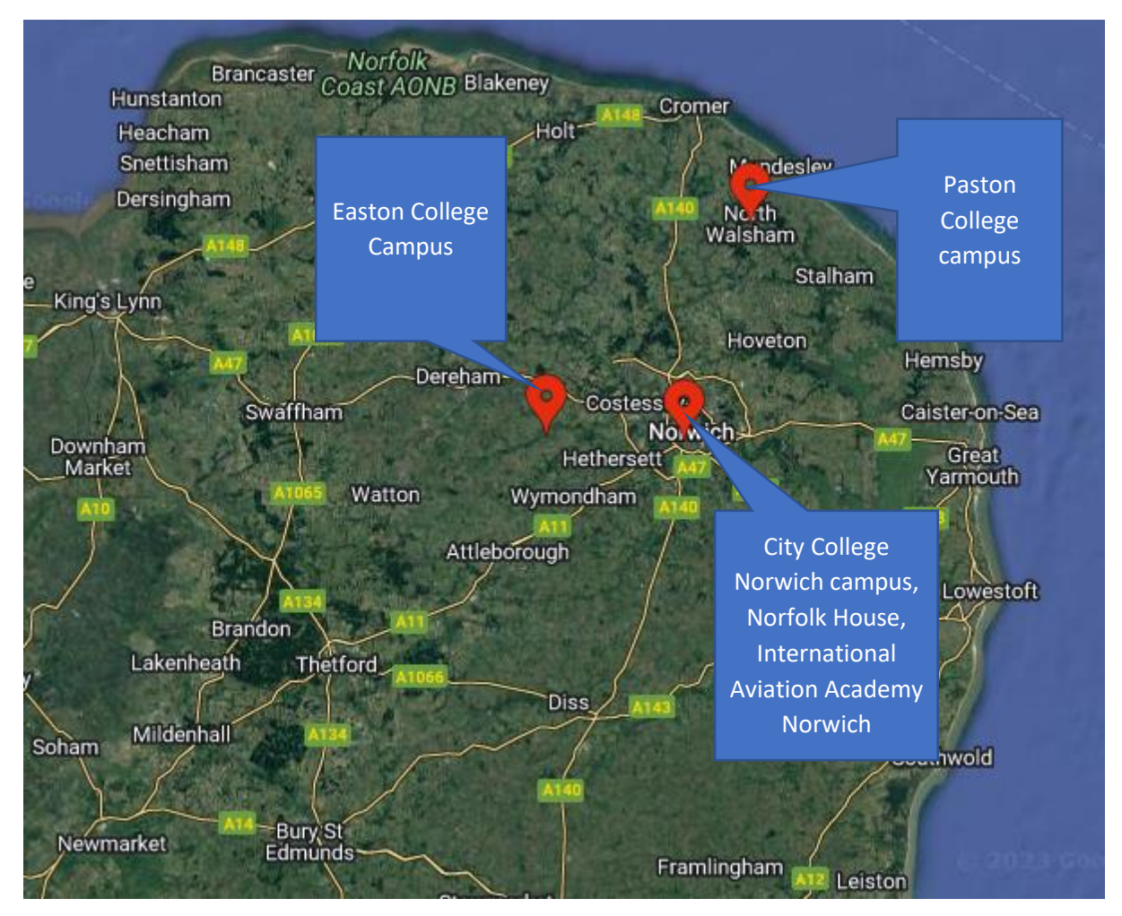
Figure 1 – City College Norwich campuses and sites

As a result of these mergers there was expansion in the number of operational sites of the College but also a significant increase the responsibility that the College had for post 16 learning and skills in Norfolk. As an example of that, the College now educates around 1/3 of all of Norfolk 16-18 years olds who are studying in colleges and schools.